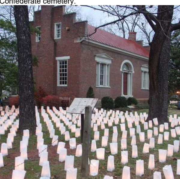
The Carter House at Franklin