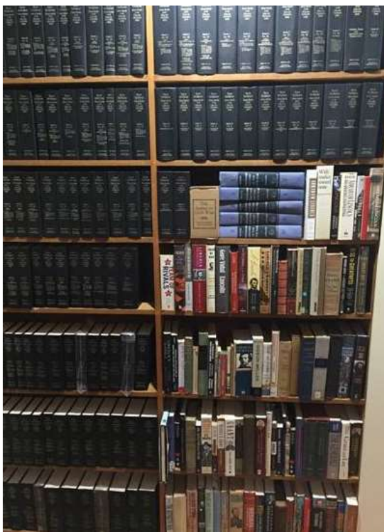
Part of the more than 500 books for sale

The books left and top right are the records of both the US and Confederate governments. It's a 150-volume set. Below right are mainly union side biographies. For further information please contact: president@americancivilwar.asn.au