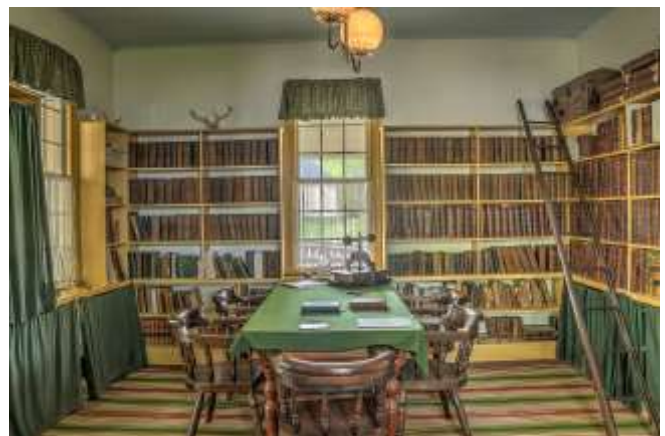
The library in "Liberty Hall" where, from 1868 to 1870, A H Stephens wrote the book " Constitutional View of the Late War between the States ".

"rests upon the great truth that the negro is not equal to the white man; that slavery, subordination to the superior race, is his natural and normal condition. This, our new government, is the first, in the history of the world, based upon this great physical, philosophical, and moral truth. This truth has been slow in the process of its development, like all other truths in the various departments of science."