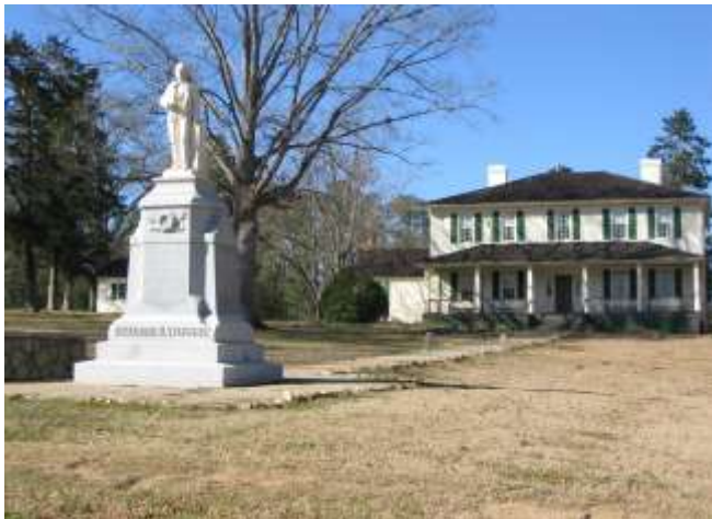
"Liberty Hall", Crawfordville, Georgia, now a museum (with statue), was built by A H Stephens before the War

appointed commander-in-chief of Confederate armies, and had indicated his willingness to so serve. However, when the convention adopted the same provision as was in the US Constitution that the President was also to be commander-in-chief, Davis's election to the presidency was assured. Stephens was elected Vice-President, a position he held for the entire War.