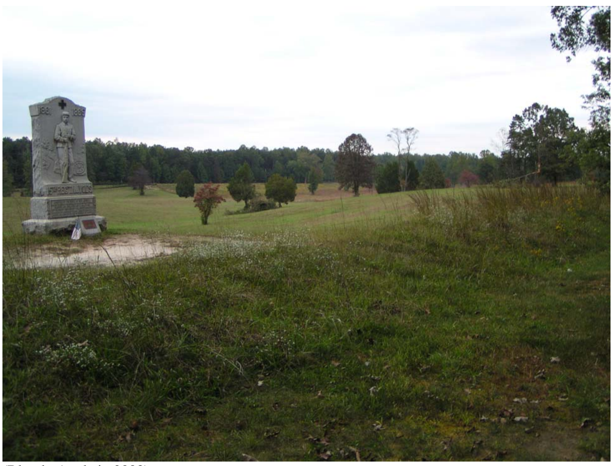
(Bloody Angle in 2003)