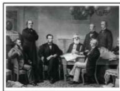
First Reading of the Emancipation Proclamation, by Francis Bicknell Carpenter

This month's quiz question focuses on the first reading of the Emancipation Proclamation and invites you to name each of the people in the photograph below in correct order from left to right: